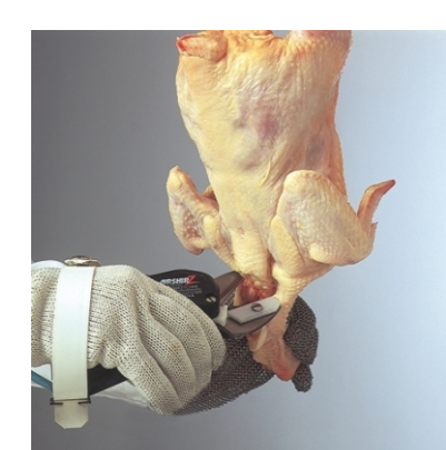
Magnum delivers extra cutting power for tough applications like neck breaking.

AirShirz reduces the force required to operate the tool while it increases the contact area, so overall contact stress is greatly diminished.