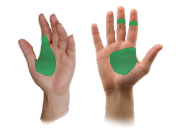
With AirShirz, increased surface contact spreads force over a larger area for improved operator comfort.

AirShirz reduces the force required to operate the tool while it increases the contact area, so overall contact stress is greatly diminished.