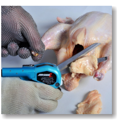
Trimming Fat Pad