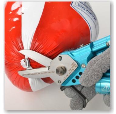
Clip Removal / Cutting Netting