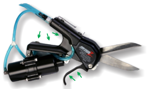
Comfort fit design.

Scissors have more pressure points and require more effort to open and close.